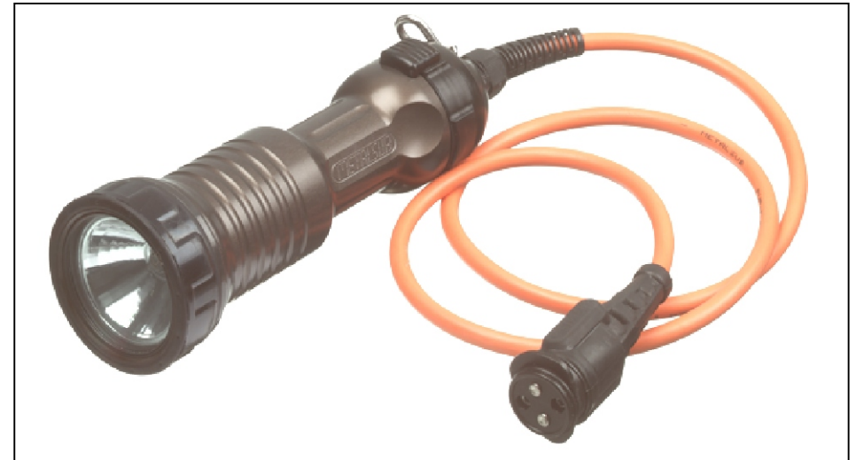
METALSUB Cable light HID125 € 05

Cable light HID 125 batterypack PR1205/12085/PR1213 battery pack FX1206/1209